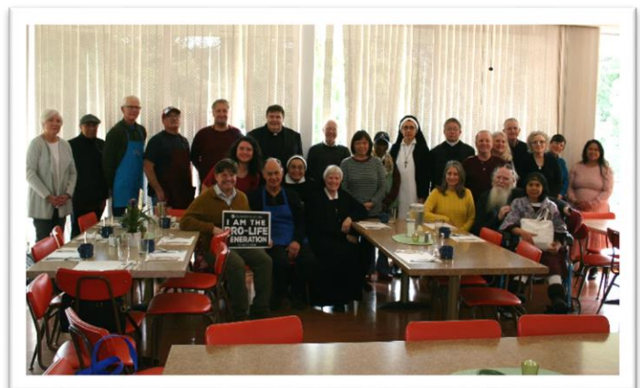
Cultura Vitae Retreat (February 2024)